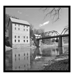
Location: Motor Mill Historic Site