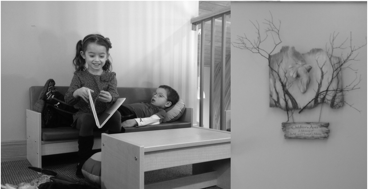
Left: Children reading in the Children's Area. Right: Sign welcoming people to the Children's Area.