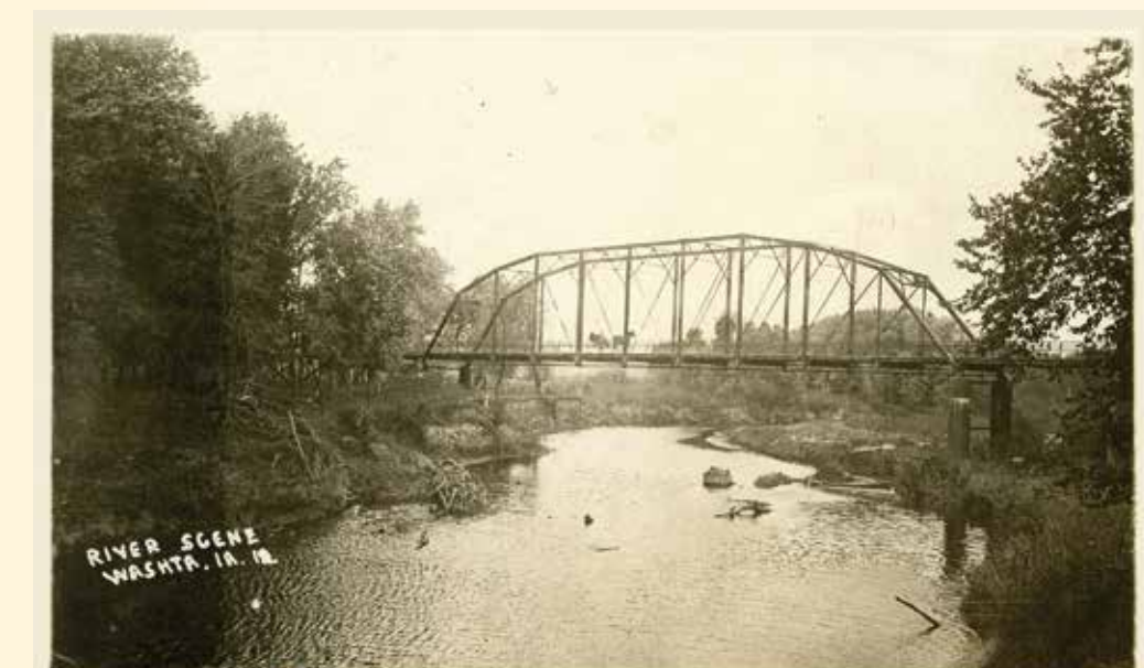
This postcard, postmarked in 1915, depicts one of a succession of bridges over the Little Sioux River at Washta. Bridges across the river were crucial for daily life and commerce and were often victims of floods and freshets (ice-outs in spring). As you paddle, you may come across remnants of past infrastructure that graced the Little Sioux in historic times.