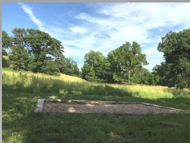
SITE #1 - HOHNEKE POND