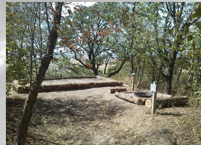
SITE #3 - COTTONWOOD