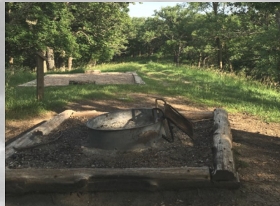
SITE #2 - FOX RUN RIDGE