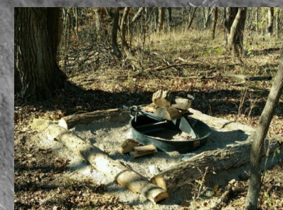
SITE #7 - HERITAGE