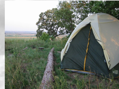
SITE #4 - HIGHPOINT