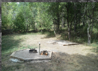
SITE #5 BADGER

More info online at: http://www.pottcoconservation.com/