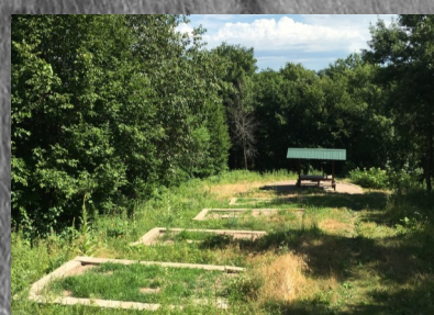
SITE #6 - SHEA WAY