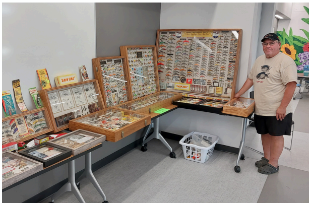
Lazy Ike Gathering