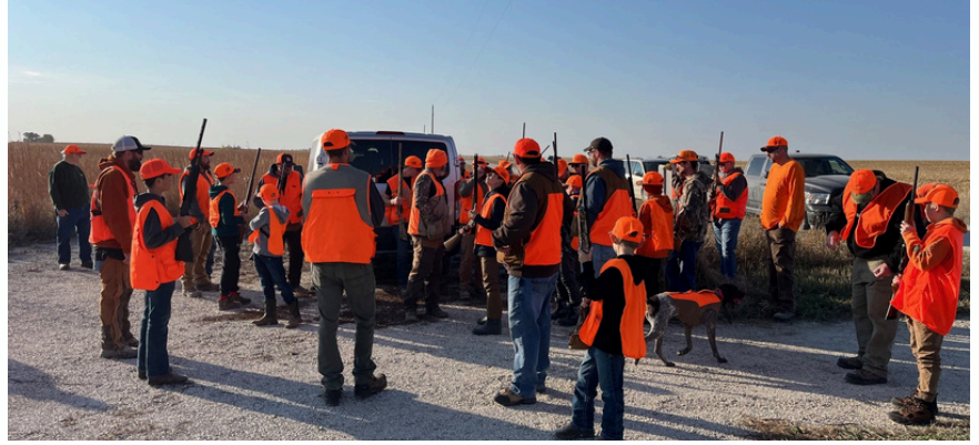
Youth Pheasant Hunt