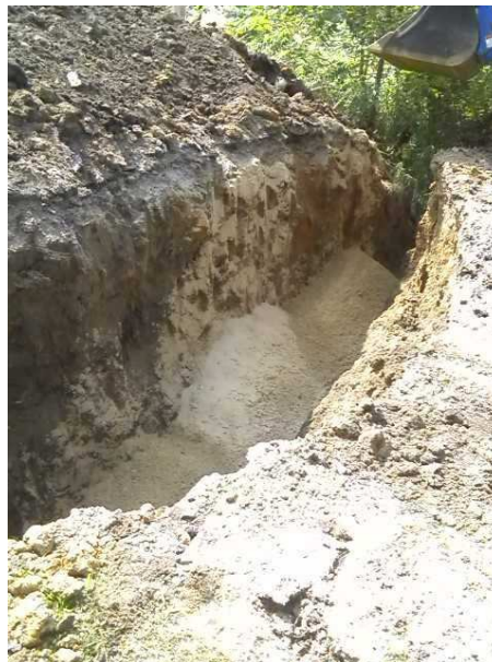
UYC Culvert Project