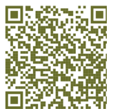
On-line Volunteer Form