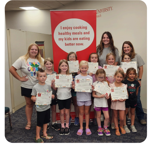
Ready, Set, Cook