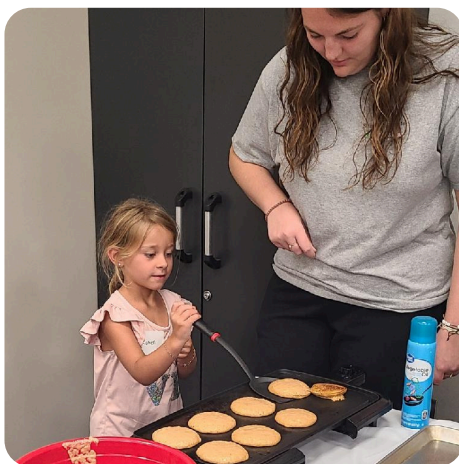
Ready, Set, Cook